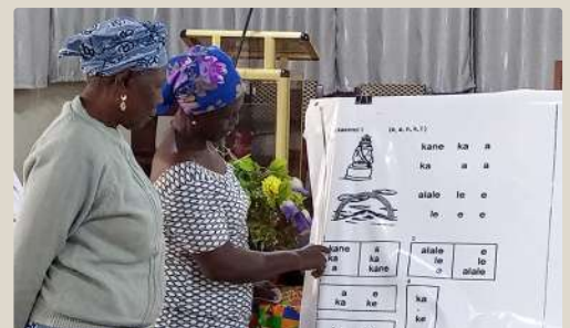
Demonstration at Teacher Training Workshop at Dodowa