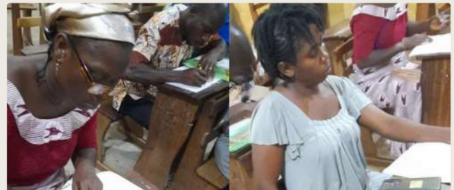
COP Kaneshie Literacy Class (Final Exams)