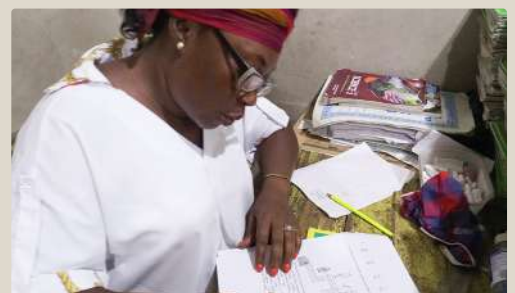
Learner writing her exams (Dansoman Mock Exams)