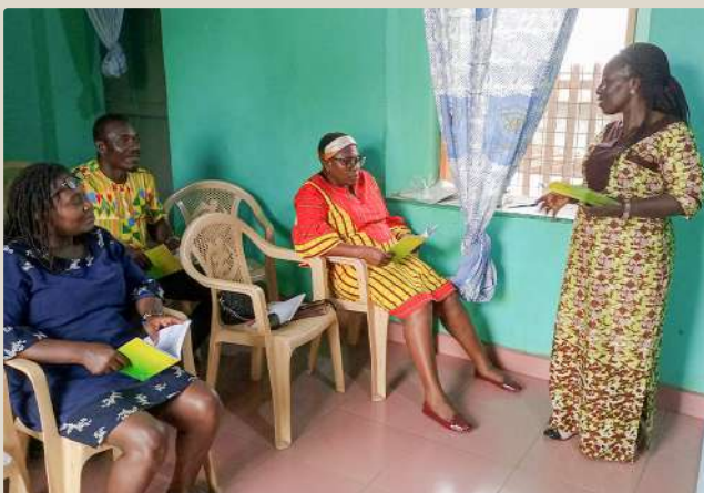
Teacher Training Workshop (Odumase Krobo)