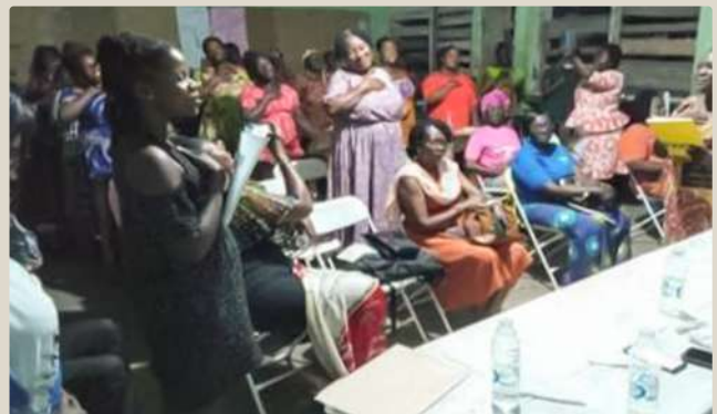
Literacy class, FGBMFI at Tema

November: By God’s grace we were able to print and send copies of the Hausa and Tangale primers to our colleagues in L&E Nigeria for their TTW and launch of both primers. On November 21, we had our annual retreat at the Trinity United Church, Children’s block. We also used the occasion to finalize our Action Plan for the year 2023. On November 24, we conducted the final exams for the Kasoa Area Literacy Class . All the five learners passed the exams and are getting ready for their graduation in 2023!