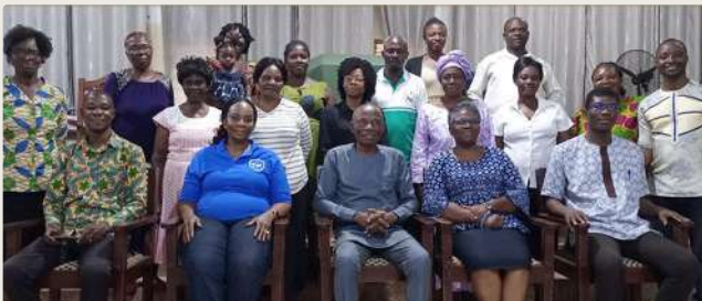
Teacher Training Workshop - Dodowa in July

December: The Kaneshie Area Literacy Class had its final exams on December 20, bringing the number of all Areas within the COP Literacy Project which have started literacy classes from the scratch and completed all 82 lessons in the L&E Ghana syllabus to three (3). Indeed, it has been a year long journey since the Teachers were trained at the Pentecost Convention Center (Accra & Kumasi) and Radach Center in Tamale between October and December 2021.