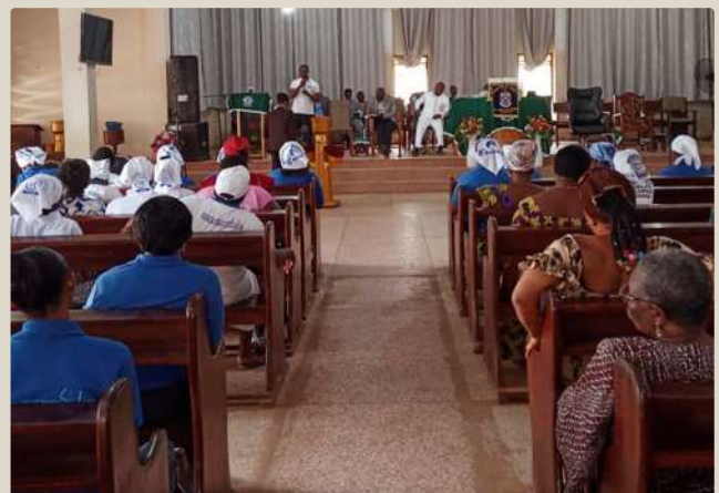
8 September, 2022 - World Literacy Day Celebration at Dodowa