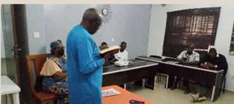
Hausa Primer Construction in Abuja, Nigeria