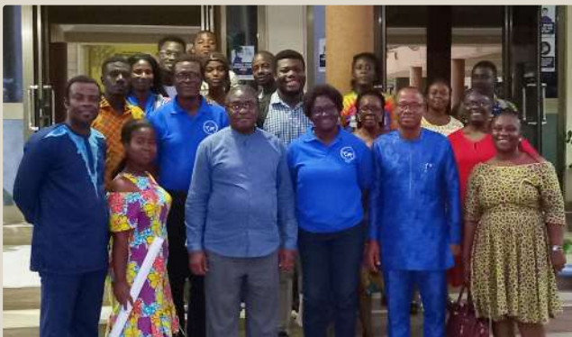
Trainer of Trainers Workshop for Church of Pentecost Koforidua Area

They set up the literacy classes for the market women a few weeks after their training. This class of market women only is the first of its kind in our setup. The class also engages in morning devotions, open to all in the market and is led by the ladies of FGBMFI who also double up as the teachers for the evening literacy classes.