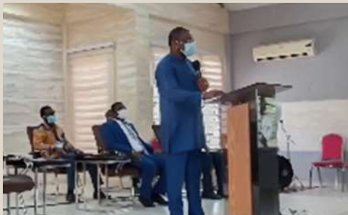
COP Literacy Project