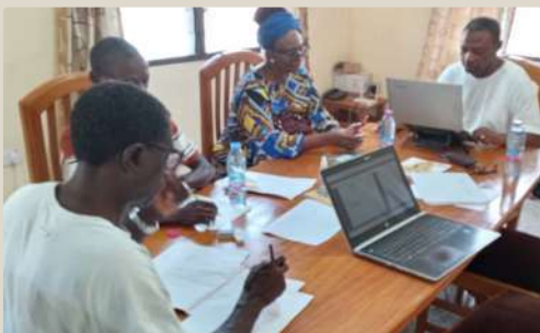
Nzema Primer Construction Workshop

March: We had follow-up meetings with COP NDLD members on the COP Literacy Project . We submitted our Training Report for the Greater Accra, Eastern, Volta, Ashanti, Brong-Ahafo and the Northern regions to them and discussed progress and challenges of the Literacy Project.